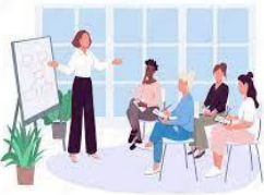
Illustration by [unreadable]